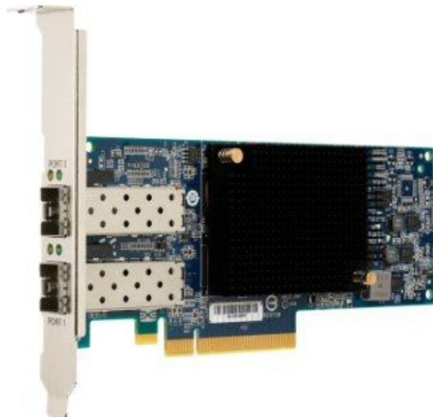
Figure 3. Emulex 10GbE Integrated Virtual Fabric Adapter II (without optional SFP+ transceivers)

The Emulex 10GbE Integrated Virtual Fabric Adapter II (Figure 3) has the same functional characteristics as the Emulex 10GbE Virtual Fabric Adapter II (Figure 1). This adapter must be purchased at the same time as the new IBM eX5 server (x3850 X5 and x3690 X5). It is factory installed into a standard PCIe slot, and is offered at a price savings compared to the Emulex 10GbE Virtual Fabric Adapter II. There is a limit of one Emulex 10GbE Integrated Virtual Fabric Adapter II per system. The Emulex 10GbE Integrated Virtual Fabric Adapter II is shown in Figure 3.