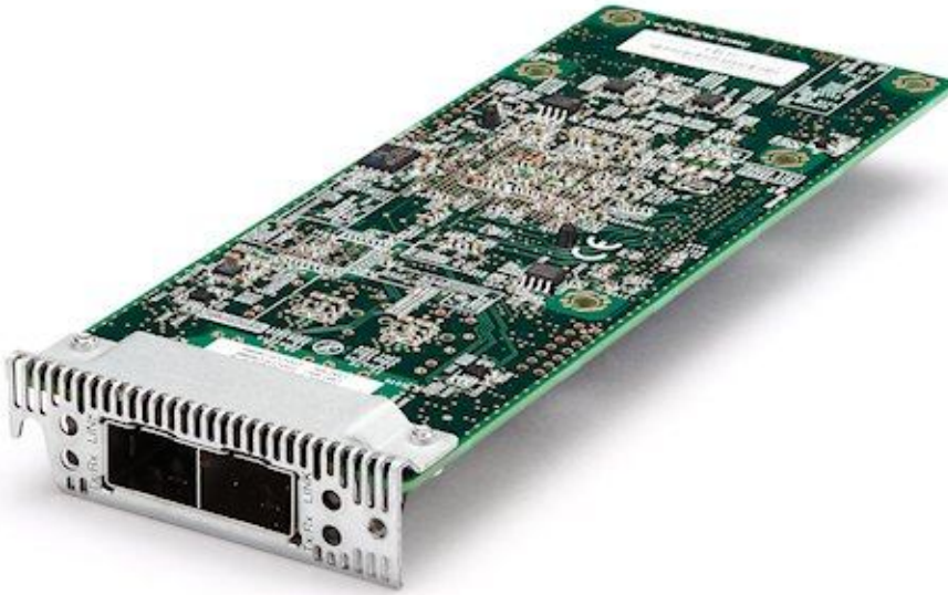
Figure 2. Emulex VFA III and VFA IIIr Embedded Adapters

The Emulex Embedded Adapters are designed to fit into a special slot in selected servers (see Table 4), allowing you to use the PCIe slots for other technologies. The adapters are shown in Figure 2.